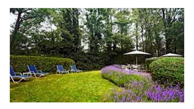
Four Points Rue Paul Spaak 15 1000 Brussels

Friday, June 26, 2015 6:30 p.m. to 9:00 p.m.