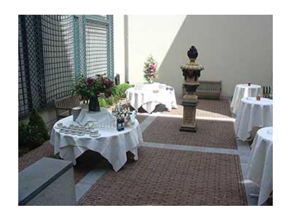
Stanhope Hotel Square de Meeûs 4 1050 Brussels

Friday, 28 August, 2015 6:30 p.m. to 9:00 p.m.