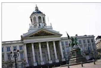
Meeting point: St. Jacques de Coudenberg

Please note that this event is limited to 25 participants.