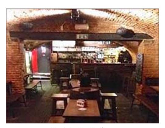
La Porte Noire Rue des Alexiens 67 1000 Brussels

Come and join other beer and Brussels lovers as we embark on another Second Tuesday Historic Bar Tour social hour near the Sablon area. We visit a very old pub (and former convent), La Porte Noire , with quite a history. From their website: